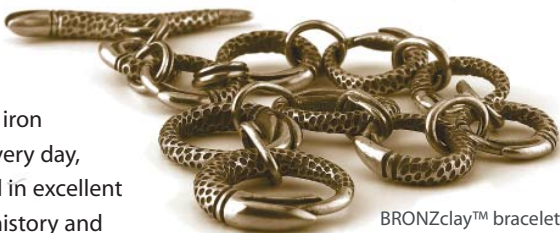
BRONZclay™ bracelet created by Celie Fago

As the metal of choice as far back as 3500BC, bronze delivered more strength and durability than iron and commanded a higher price. Every day, bronze artifacts are unearthed, still in excellent condition, still rich in color, full of history and representing an incredible combination of skill and art.