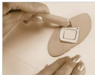
Use a sharp edge to cut BRONZclay™.