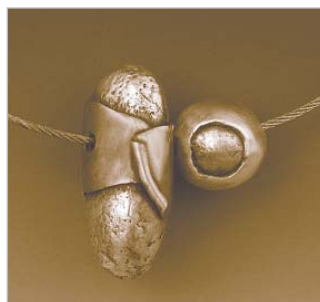
BRONZclay™ & PMC® pendant created by Hadar Jacobson

Combine equal parts of Cold-Mold™ silicone compound into a flexible putty that you can use to create your mold.