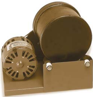
Rotary tumbler; 1 qt. #202-140

Once fired, the BRONZclay™ piece is solid metal and, like any other metal, it can be sawn, drilled, sanded, patinaed or soldered using traditional jewelry tools and materials.