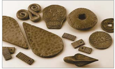
BRONZclay™ pendants and components created by Yvonne M. Padilla

Issues of safety do not arise from BRONZclay™ itself, but rather in the firing/sintering process due to the use of high-temperature kilns. Kilns should be positioned on a sturdy, stable surface, away from combustible materials, with a foot of open space on all sides. Take special precautions if the kiln is in an area where animals or young children may come in contact with it.