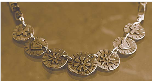
BRONZclay™ necklace created by Jeanette Landenwitch