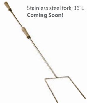
Stainless steel fork; 36" L Coming Soon!

Note: The firing schedule for thicker pieces will work fine for thin pieces should you have both thicknesses in your firing pan.