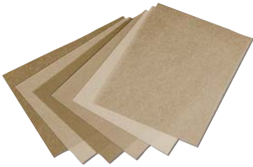
Spectrum™ polishing papers #337-216