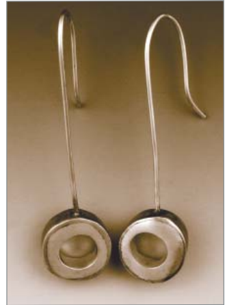
BRONZclay™ and PMC® ear wires created by Hadar Jacobson

BRONZclay™ is true bronze (although a bit less dense) and is composed of tin and copper, not the brass form that you see in most commercial bronze.