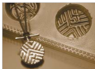
Cooking molds are ideal for use with BRONZclay™.