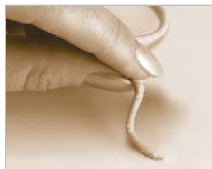
Roll out a slim rod to form a bail.