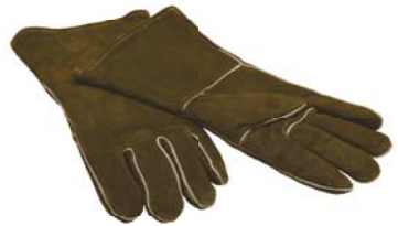
Gloves; 12" L Ladies' 350-051 Men's 350-050