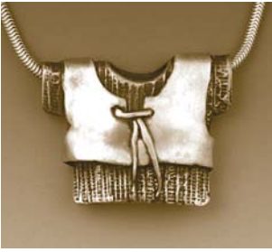
BRONZclay™ & PMC® pendant created by Hadar Jacobson

You will need to dry your BRONZclay™ piece thoroughly before firing to prevent moisture in the clay from expanding and creating defects during firing.