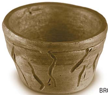
BRONZclay™ bowl created by Jeanette Landenwirth

Welcome to the next step in the evolution of metal clay: BRONZclay™! BRONZclay provides an incredible artistic range. And, because it's bronze, it's so affordable, it can be used to sculpt large pieces and create specialized tools—it can even be thrown on a potter's wheel to shape bronze hollowware. Available in generous 100- and 200-gram blocks, BRONZclay allows the artist to experiment with how far (and big!) designs can go.