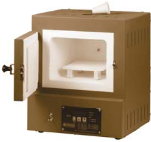
Rio 120-volt kiln #703-117