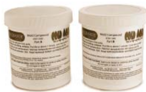
Rio Cold-Mold™ compound, 1 lb. #701-046