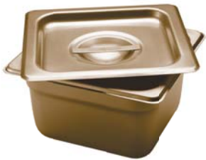
Firing pan; 7" x 6 1/2" x 4" 703-202