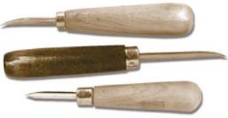
Set of three burnishers #113-033