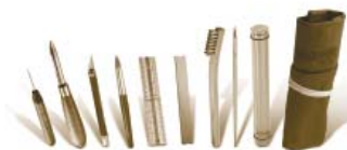
Rio tool kit #111-411