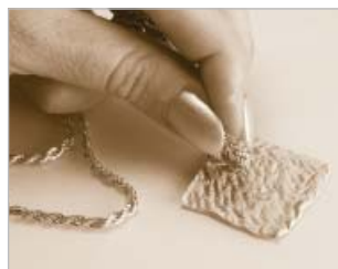
Use just about anything to add texture.