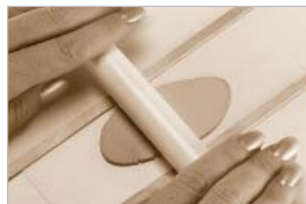
Use stirring sticks as a thickness gauge.

Note: If the BRONZclay™ becomes dry as you work, spray or brush on a little water (not too much!) and cover it with plastic wrap for a few minutes to allow it to rehydrate. If you add too much water, just set the clay aside, loosely wrapped, and allow it to dry out.