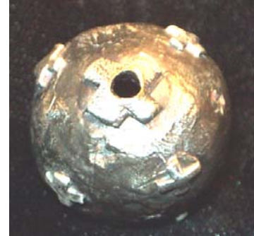
Hollow-core bead Open-work beads can be formed on a core that burns away